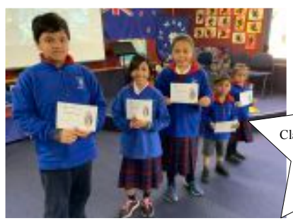
Principal's Awards 14 Sept