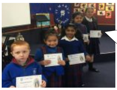
Principal's Awards 7 Sept